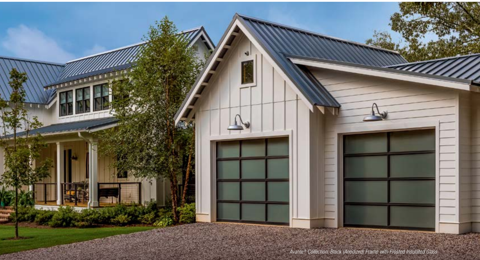
Avante® Collection, Black (Anodized) Frame with Frosted Insulated Glass